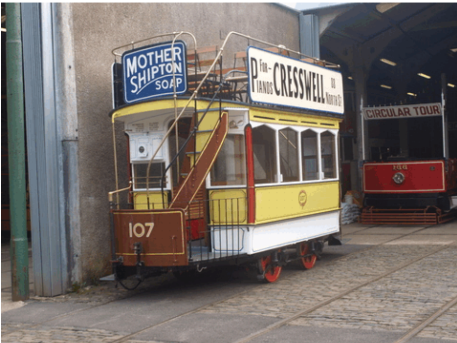
The eagle has landed! 107 outside the depot at Crich.