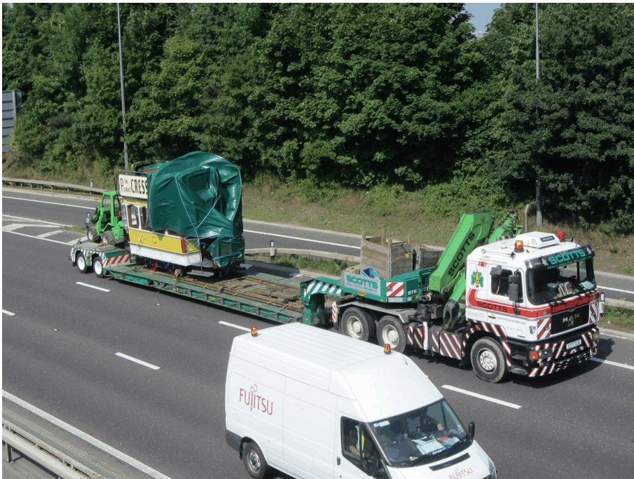
Sheeted for protection against overhanging branches, 107 travels south on the motorway