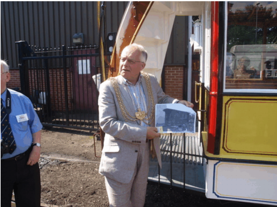
Before and after - the Lord Mayor with a photo of 107 in garden shed mode